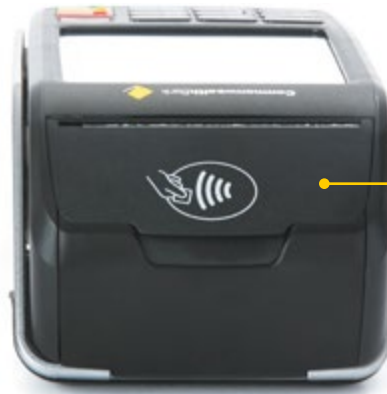
Printer Compartment Lid