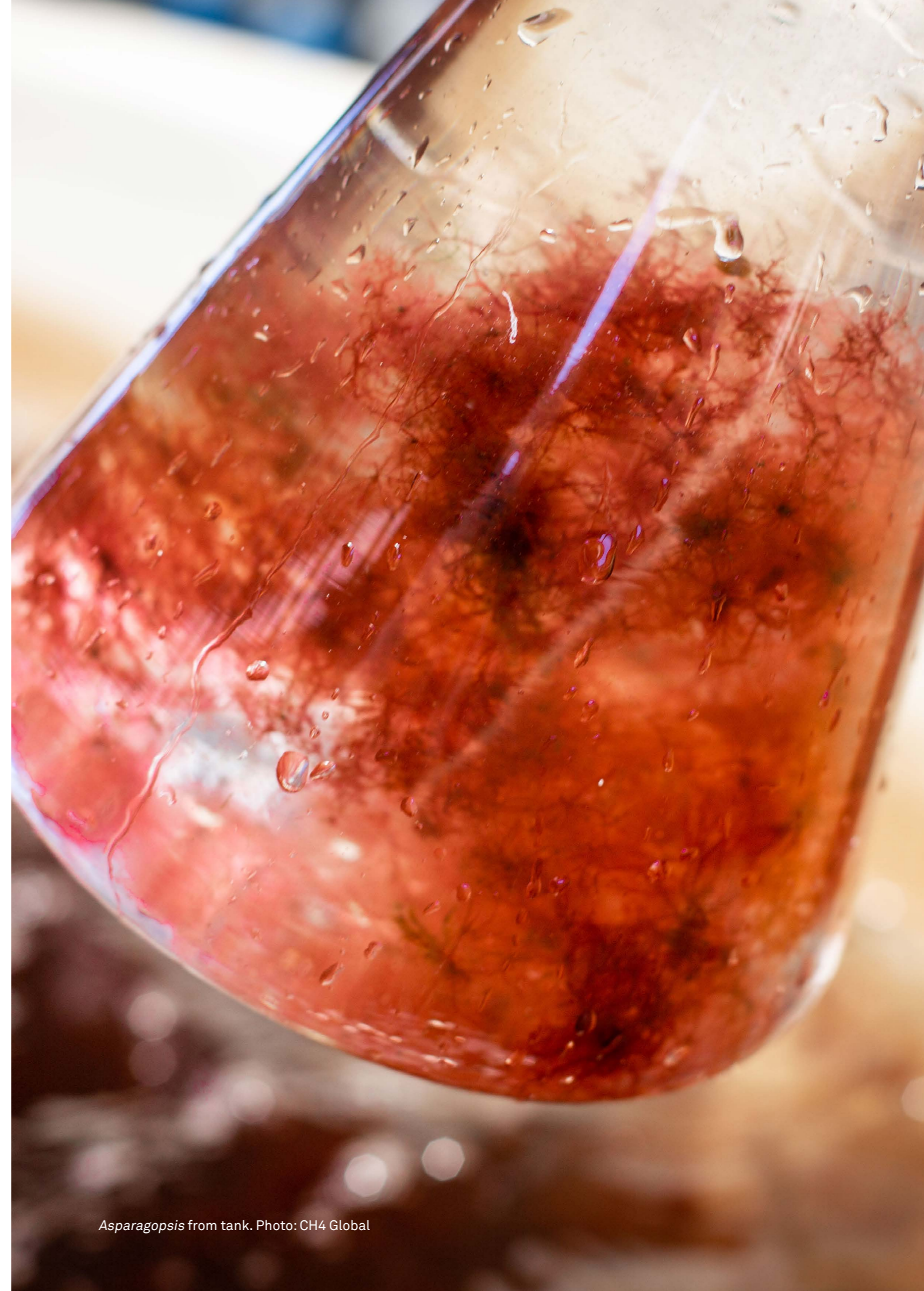
Asparagopsis from tank.