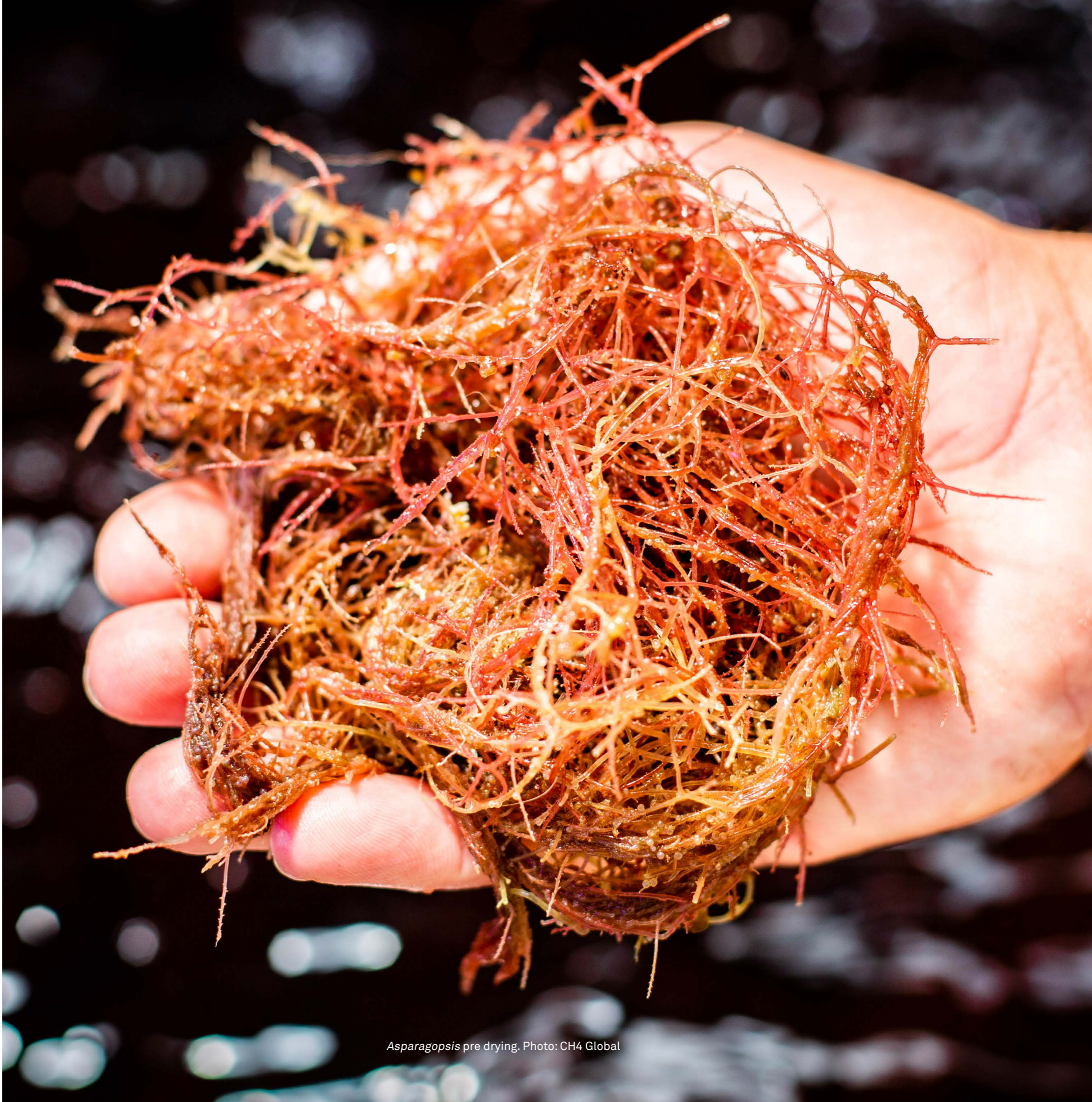
Asparagopsis pre drying.

Cover image: Asparagopsis growing natively